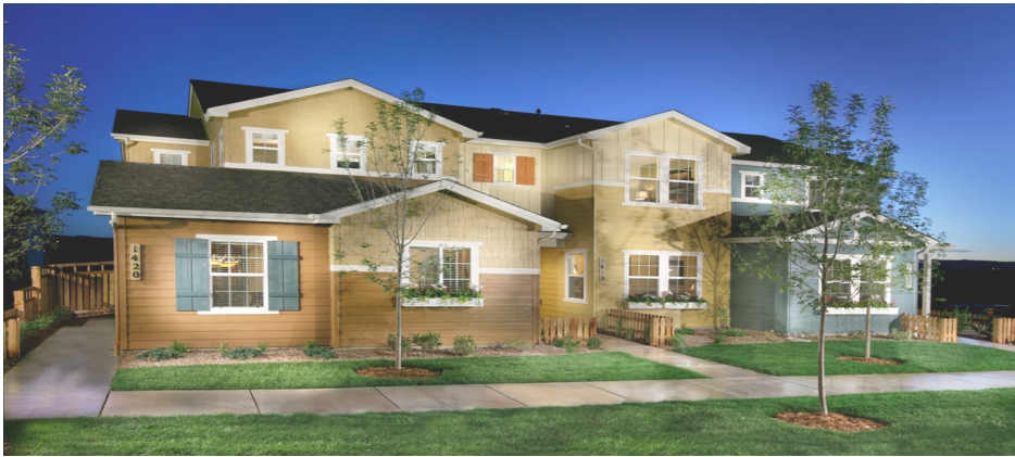
*This is an artist rendering and color/elevation may change per building. See Sales Associate for more information.